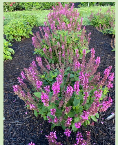
Salvia 'Rose Marvel'