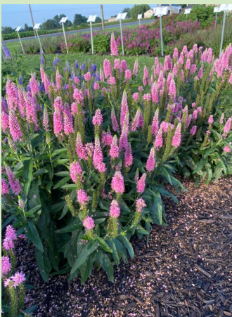
Veronica 'Skyward Pink'