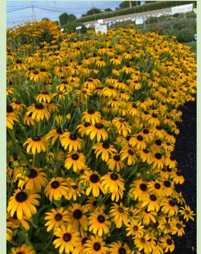
Rudbeckia 'American Gold Rush'