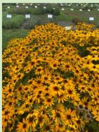
Rudbeckia hirta MiniBeckia 'Flame'