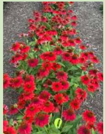
Echinacea Sombrero Salsa Red