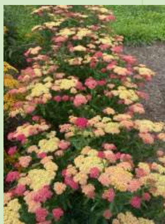
Achillea 'Sassy Summer Taffy'