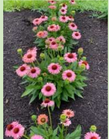
Echinacea Sunseekers 'Rainbow'