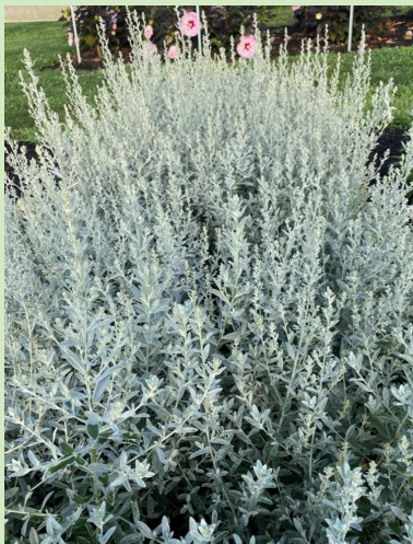
Artemisia 'Garden Ghost'