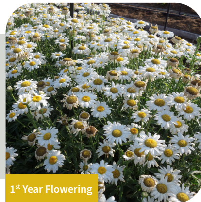
1 st Year Flowering

This is a mostly sterile Leucanthemum, with a high tolerance to botrytis.