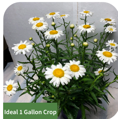
Ideal 1 Gallon Crop