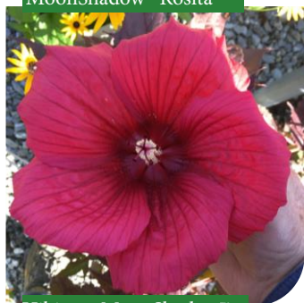
Hibiscus MoonShadow™ Morello

This new moscheutos Hibiscus variety boasts color in the garden, with fantastic contrast between the dark leaves and blossoms. MoonShadow™ emerges from dormancy 3-4 weeks earlier than others on the market and shows an onset of blooms 2-3 weeks earlier. With increased tolerance to Japanese Beetles MoonShadow™ stands out all season long!