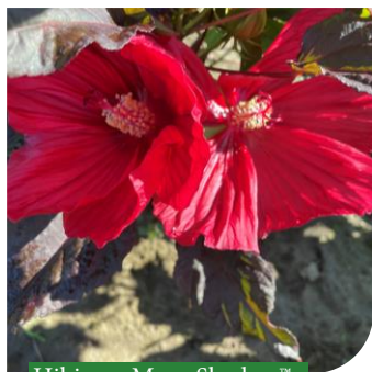
Hibiscus MoonShadow™ Carmine