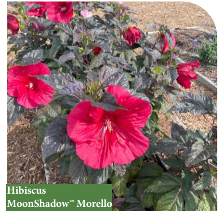
Hibiscus MoonShadow™ Morello

Always follow label instructions carefully. Test on a small portion of the crop prior to widespread application.