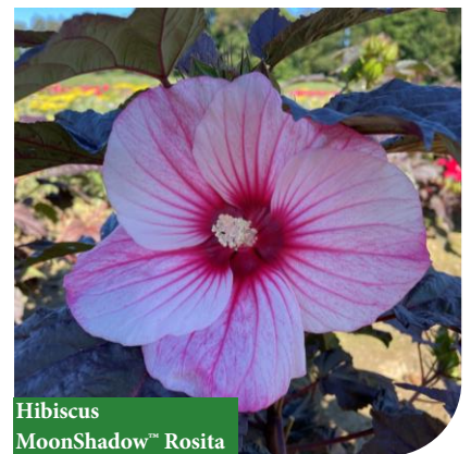
Hibiscus MoonShadow™ Rosita